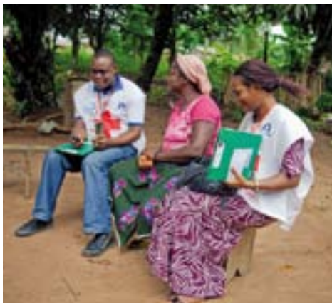
Nigerian Red Cross volunteers conduct an interview as part of the on-going monitoring survey in Cross River State.

The Centre for Evidence-Based Practice (CEBaP) of the Belgian Red Cross provides scientifically substantiated information, advice and support to Red Cross and Red Crescent partners in order to determine which activities are most effective and to create uniformity among the various activities of National Societies. CEBaP aims to create a bridge between science and practice and offers support to the Belgian Red Cross for policy implementation.