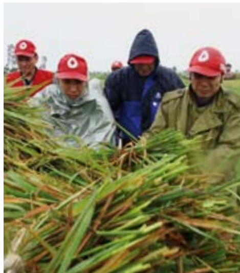
Vietnam Red Cross staff and volunteers support communities on the coast to bring in their rice harvests ahead of a typhoon.

The Climate Centre supports the Red Cross and Red Crescent Movement and its partners in reducing the impacts of climate change and extreme weather events on vulnerable people.