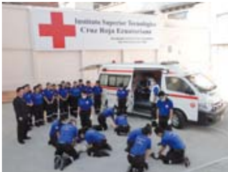
Students attending CPR session at the Ecuadorian Red Cross Technological Institute facility.

The Regional Reference Centre for Medical Emergencies and Pre-hospital Care (CREMYAP) aims to assist members of the International Federation of Red Cross and Red Crescent Societies in the Americas in strengthening National Red Cross and Red Crescent Societies' capacity in providing pre-hospital care through the development of methodologies, tools, learning techniques, and harmonized processes, taking into account the existing knowledge and best practice of the global network of National Societies.