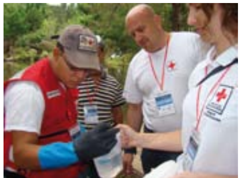
Participants at regional Water and Sanitation training.