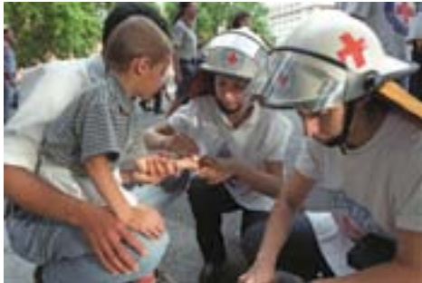
Argentinian Red Cross volunteers provide first aid to community members.

The Global First Aid Reference Centre (GFARC) is the IFRC's technical expertise hub, providing first aid information and related support to Red Cross and Red Crescent National Societies around the world.