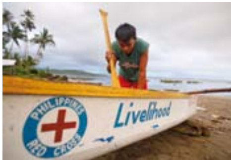
A resident prepares his boat before sailing to fish with the help of the Philippine Red Cross livelihood assistance project after Typhoon Bopha.

The Livelihoods Resource Centre (LRC) spreads awareness of effective livelihoods programming strategies, and helps IFRC members to enhance community capacity and individual skills, restore and sustain sustainable livelihoods, and thereby establish more secure living conditions. The LRC is also a network of community-based livelihood experts, who can pass on knowledge, develop methodologies and policies, build capacity, and provide technical assistance.