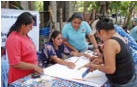
Red Cross volunteers in Guatemala show a new water treatment system with enough water for 85 households and a school.

The Reference Centre for Community Resilience (CRREC) specializes in methodologies for investigating, systematizing, validating and analysing community education with respect to disaster preparedness, prevention, mitigation, and early warning. By developing innovative and complementary tools and methodologies, it aims to reduce the vulnerability of communities across Latin America.