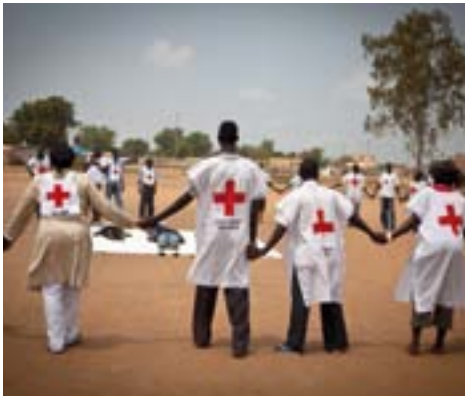
South Sudan Red Cross volunteers take part in a training in preparation for the independence celebrations.

The Reference Centre on Volunteering develops, promotes, facilitates and manages knowledge on volunteer management and volunteering development in Europe.