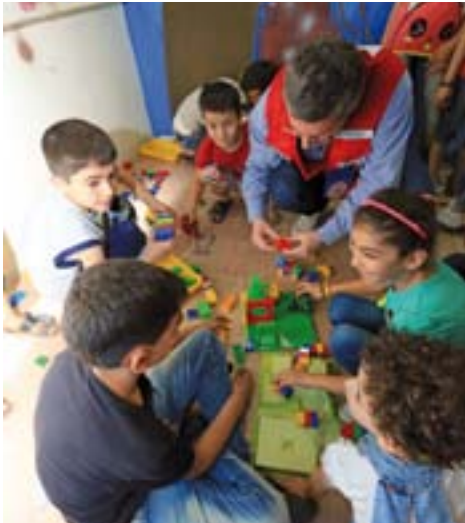
Volunteers play with a group of children at the psychosocial centre in Dweila, Syria.

The Reference Centre for Psychosocial Support (PS Centre) assists National Societies to provide psychological and psychosocial assistance, raises awareness of psychological reactions to disaster and social disruption, promotes restoration of community networks and coping mechanisms, and improves the provision of emotional support to staff and volunteers.