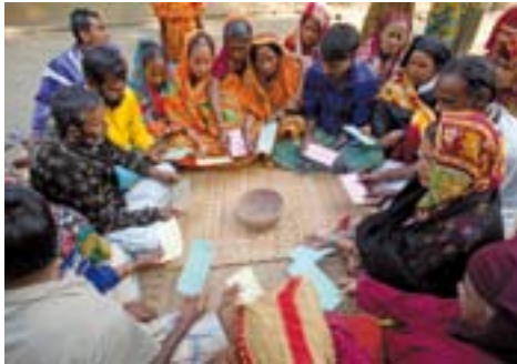
Residents practice using a participatory tool that allows communities to improve their living environment, build safer shelters and design better settlements.

The Global Disaster Preparedness Centre (GDPC) helps to enhance the disaster preparedness capacities of Red Cross and Red Crescent national societies and the wider humanitarian community. It provides specific network-wide services in response to national and community demands for tools and learning on disaster preparedness and resilience.